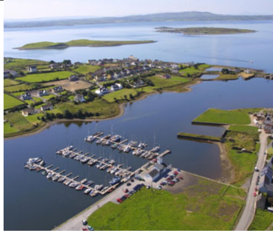
Photo: Kilrush & Scatterry Island