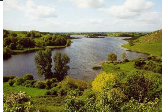
Photo: Lough Gur