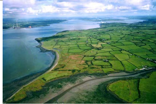
Photo: Shannon Estuary