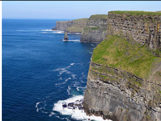
Photo: Cliffs of Moher