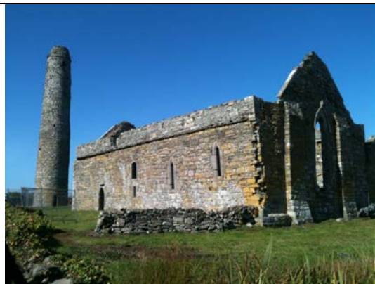
Photo: Scatterry Island, archaeological sites