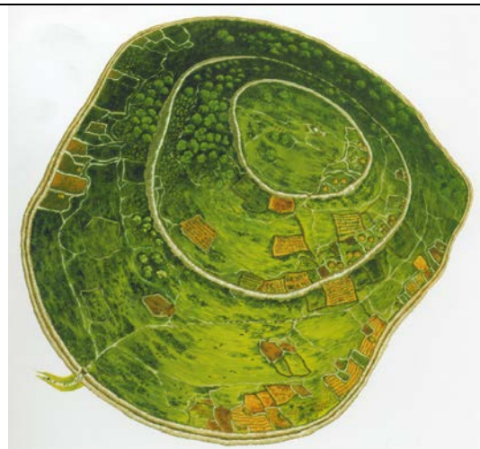
Photo: Mooghaun Hillfort